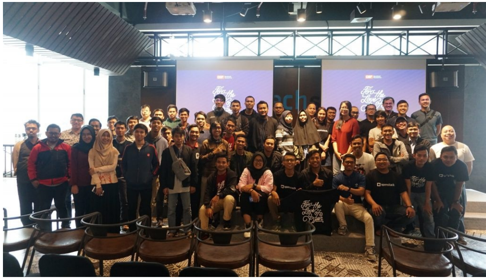
Birthday celebration from the Indonesia OpenStack User Group